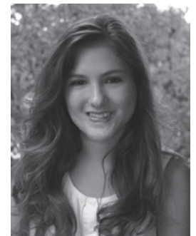
After dozens of surgeries and laser treatments she is now a most beautiful and confident 15-year-old young woman.